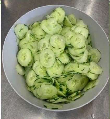
Sunomono prepared by JoAnn from freshly picked cucumbers

JoAnn prepared grilled eggplant with these freshly picked eggplants.